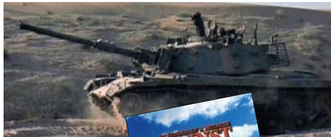
Images from Bill McKay’s unique DVD documentary entitled, Against All Odds .