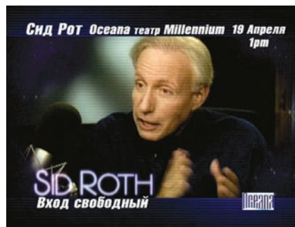
Image from our Russian TV advertisement.