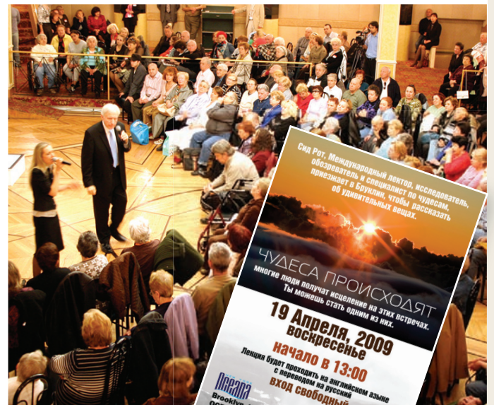
Top: Theater where we held our outreach. Above left: Volunteers distributed flyers inviting Russians to the meeting.