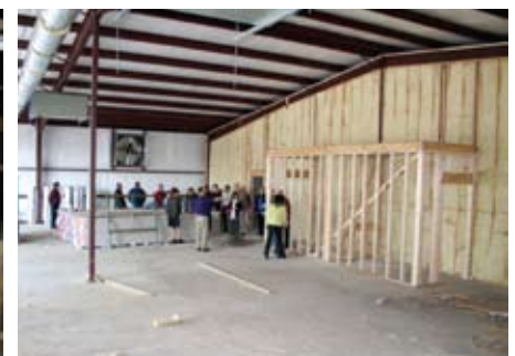
By the time you read this, we should be moved into our new building, which is twice the size of our old facilities!