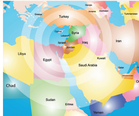
Middle East Television Broadcast Map

Watch the replay of our live program announcing the purchase of METV at SidRoth.org/METV . Includes a special appearance by Pat Robertson.